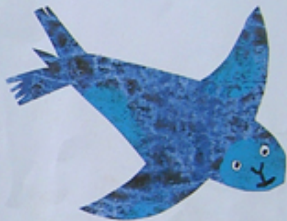
a sea lion,