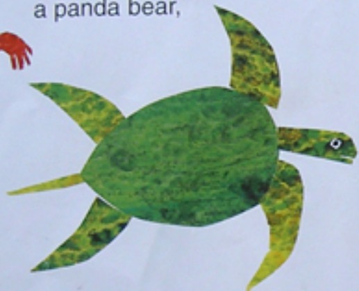
a green sea turtle,