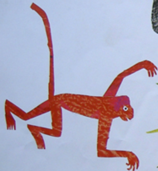
a spider monkey,