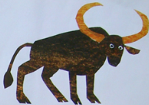
a water buffalo,