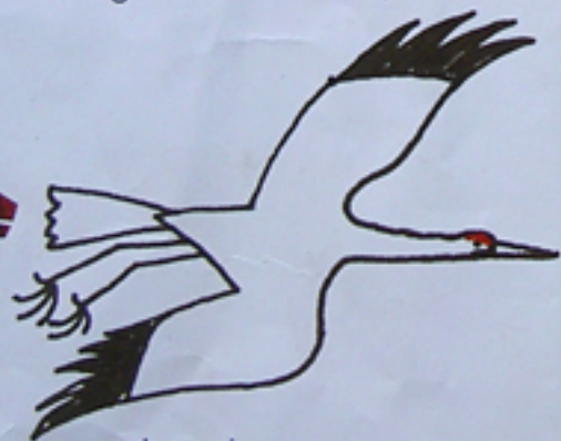
a whooping crane,