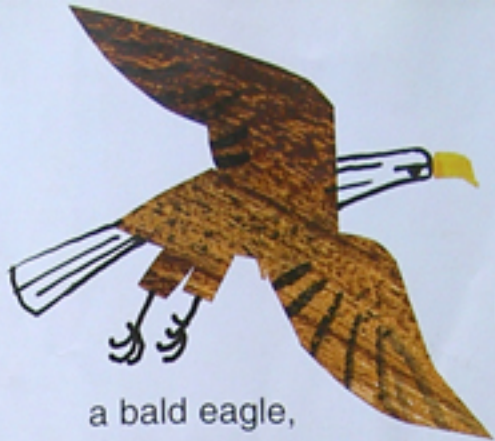
a bald eagle,