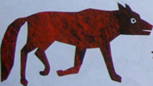
a red wolf,