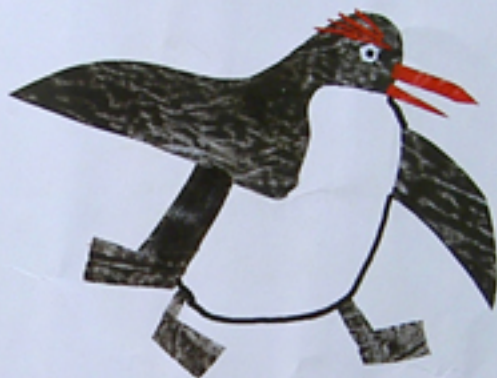
a macaroni penguin,