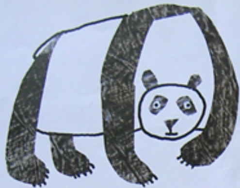
a panda bear,