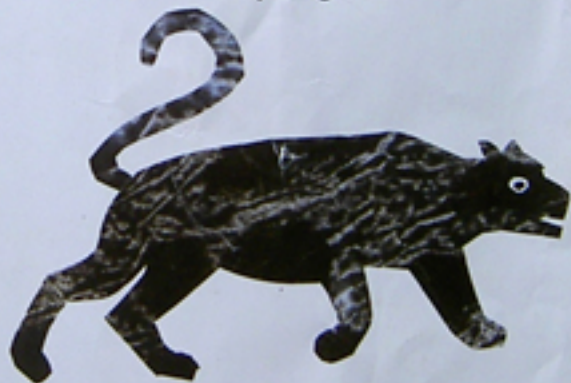
and a black panther . . .