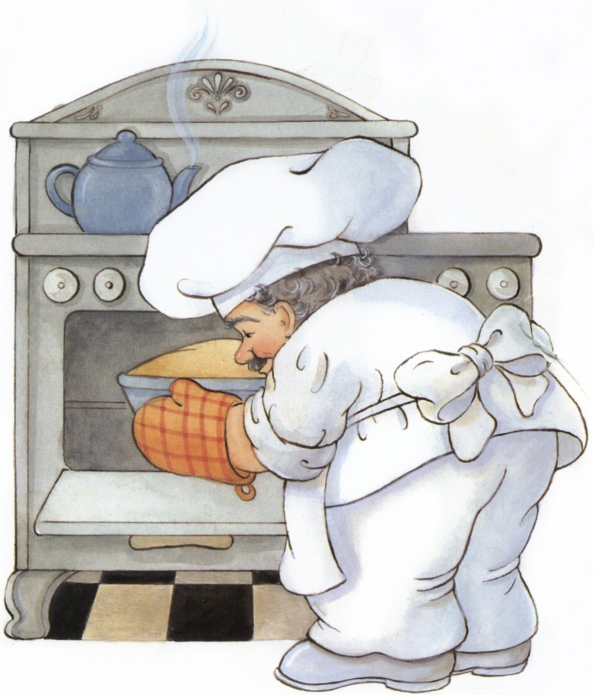
While Jake baked the cake.