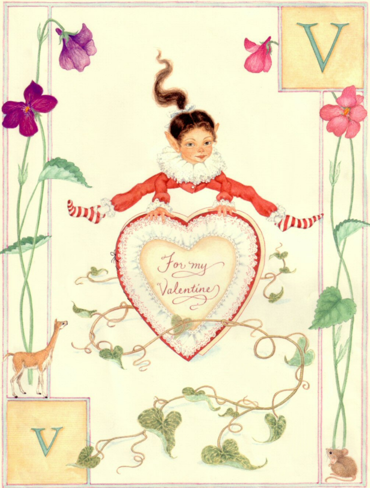
V is for Valentine Elf vigorously vaulting.