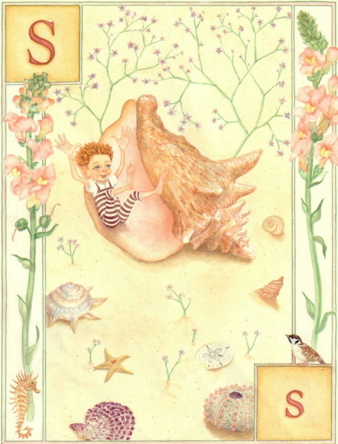
S is for Seashell Elf swiftly sliding.