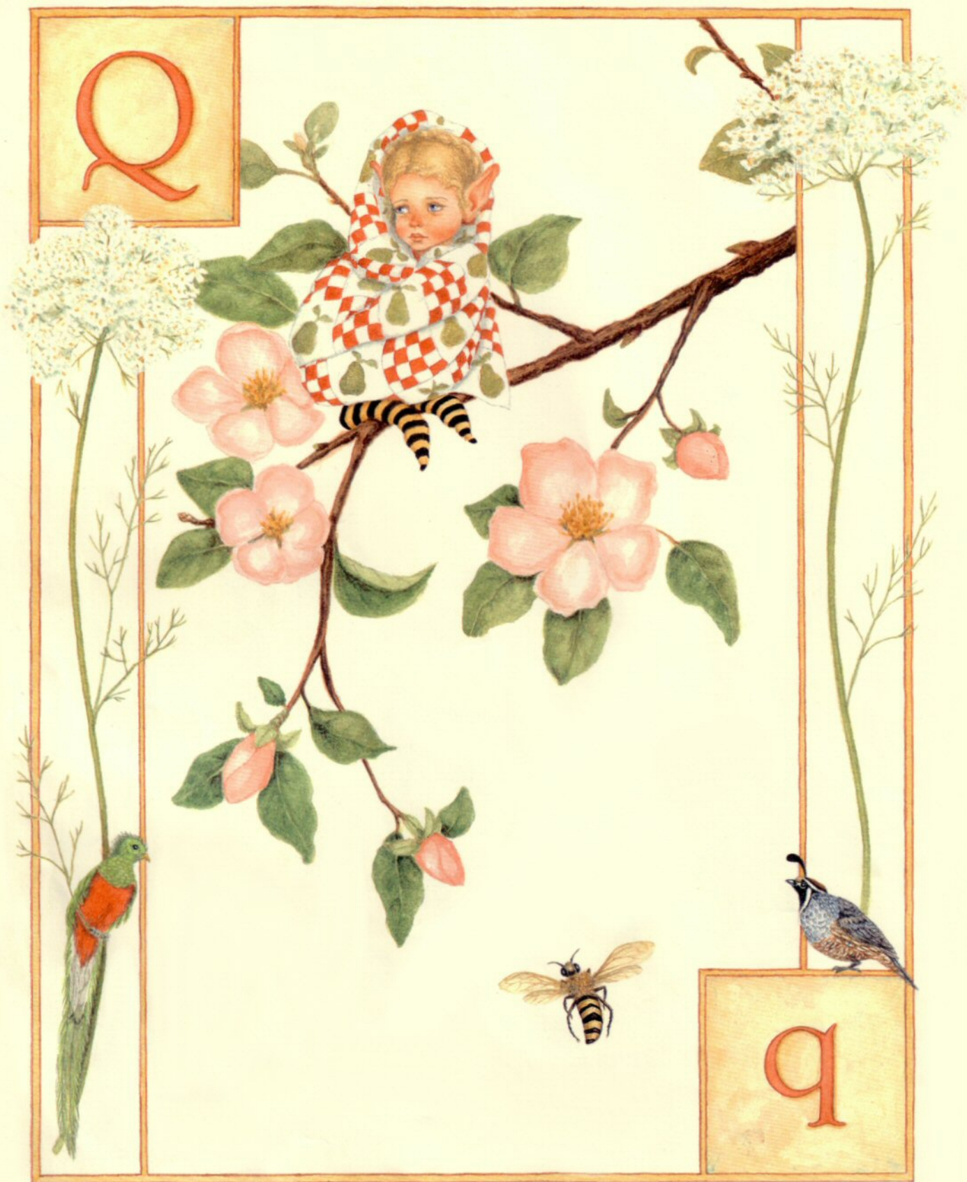
Q is for Quilt Elf quietly quivering.