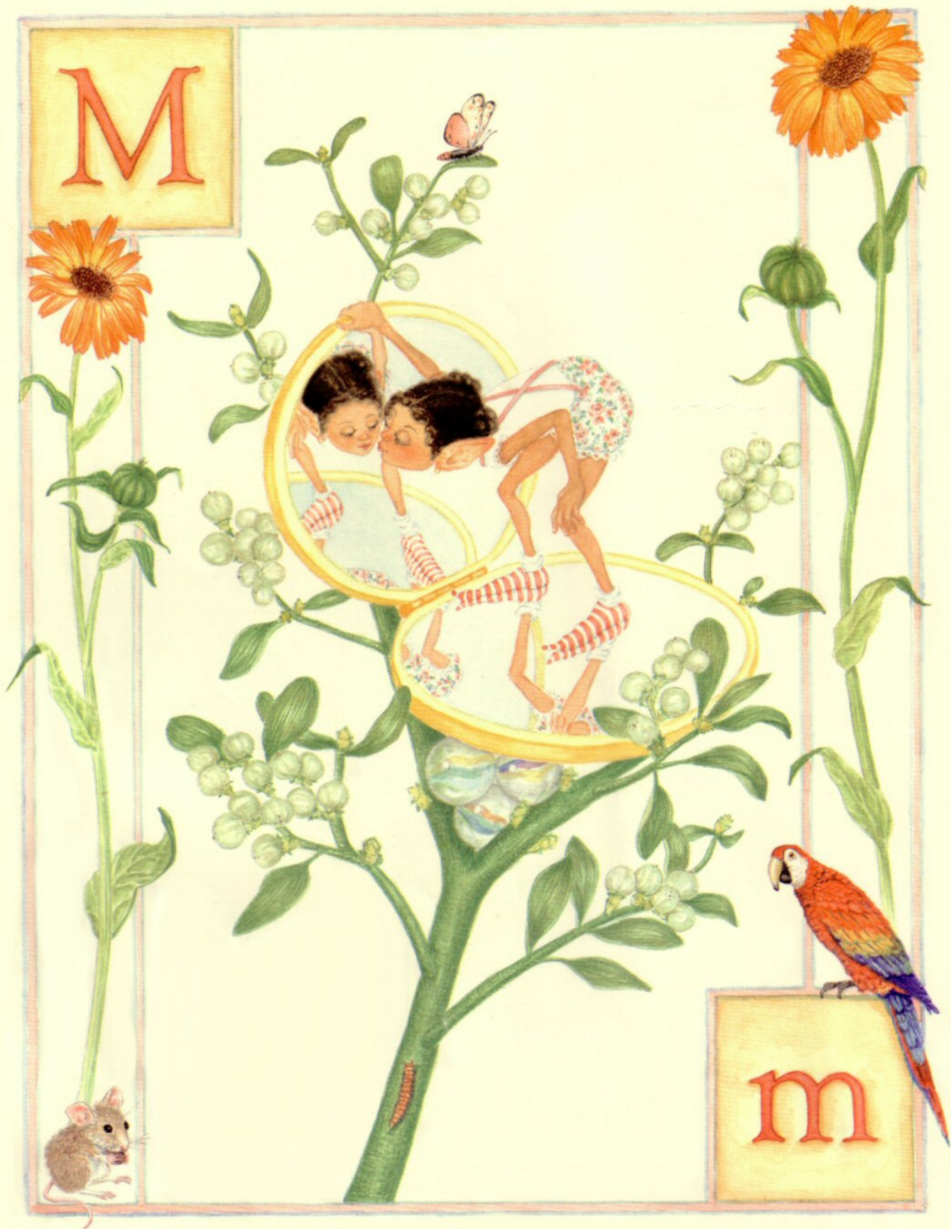
M is for Mirror Elf merrily mimicking.