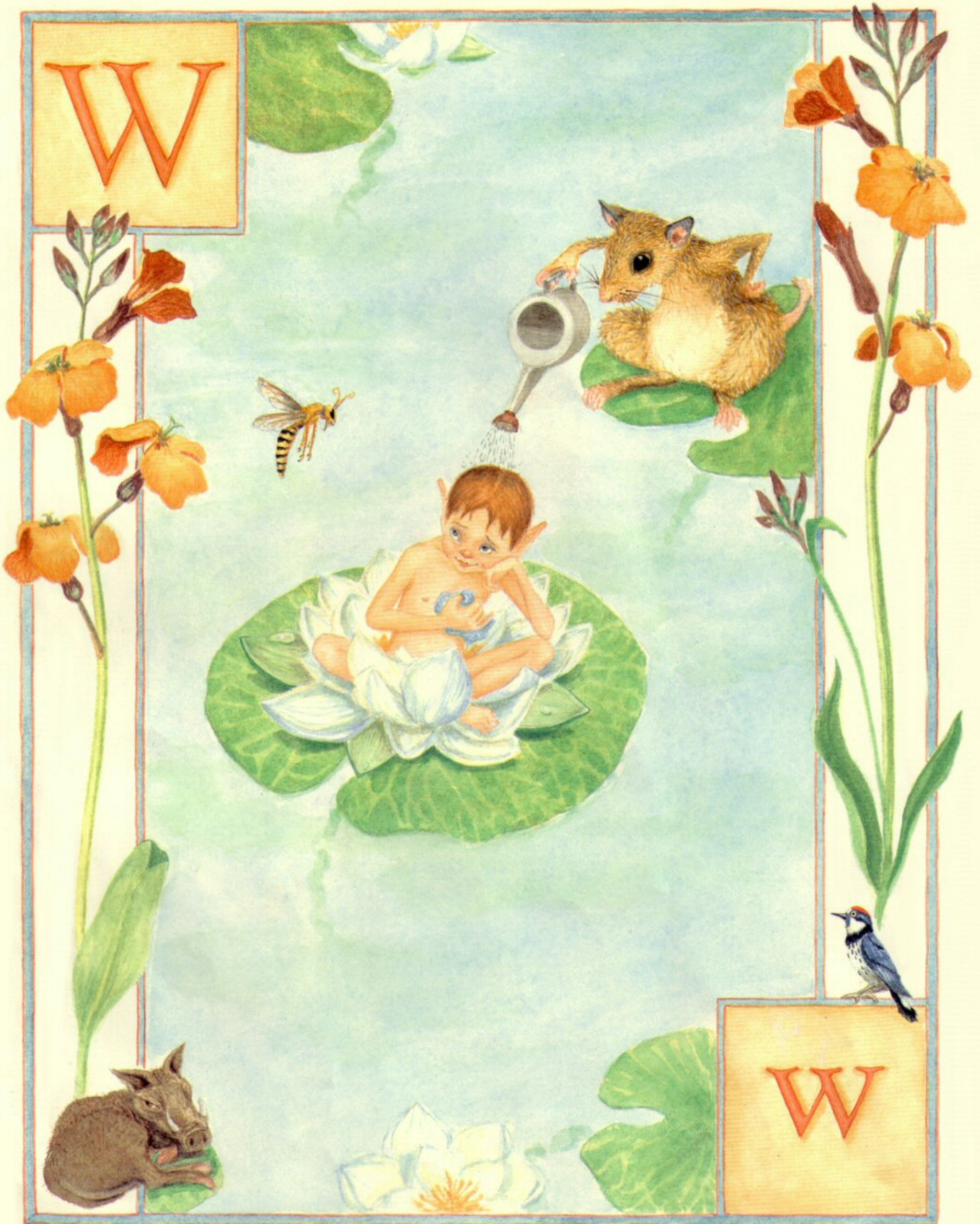
W is for Water Elf wearily washing.