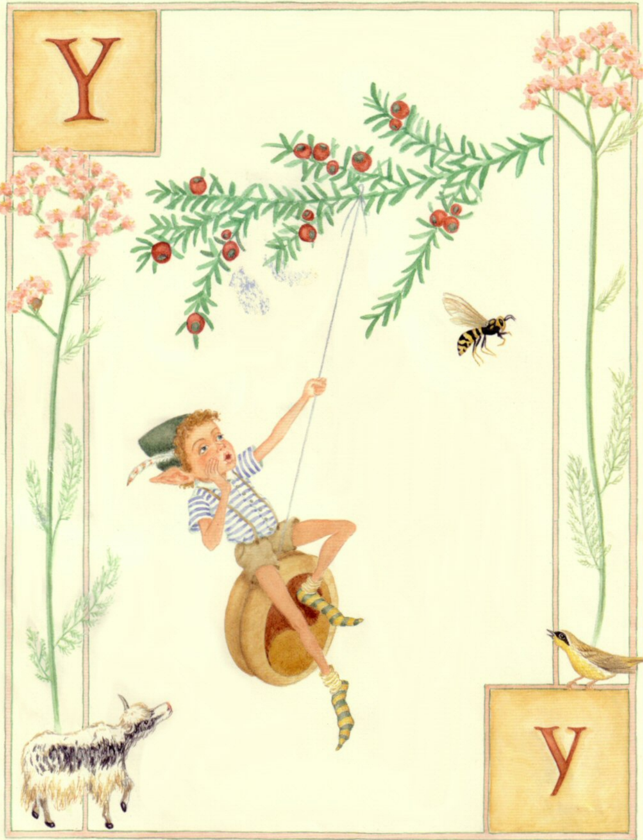
Y is for Yo-yo Elf youthfully yodeling.