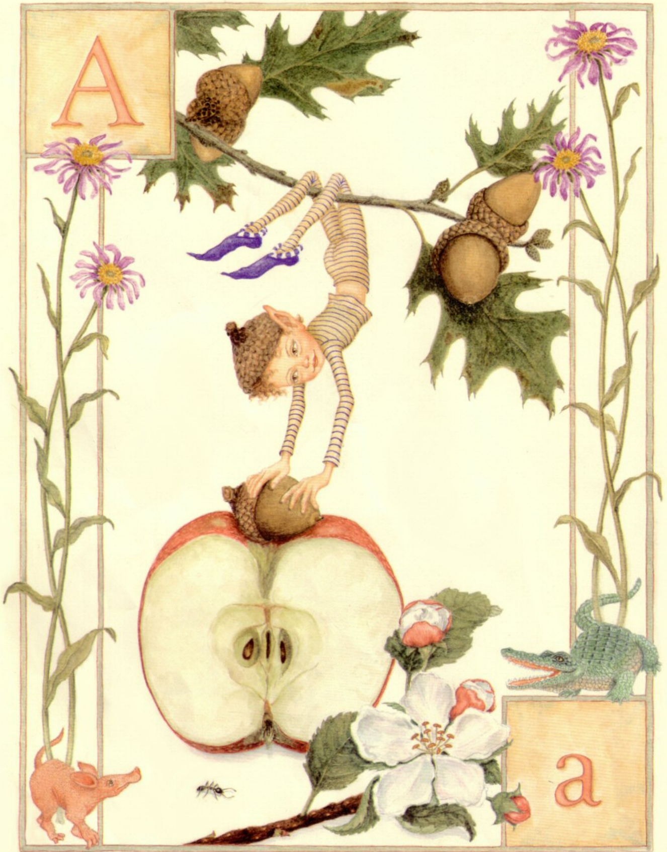
A is for Acorn Elf always acrobatic.