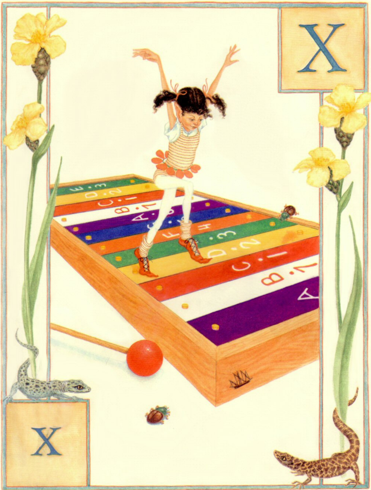
X is for Xylophone Elf eXcitedly eXercising.