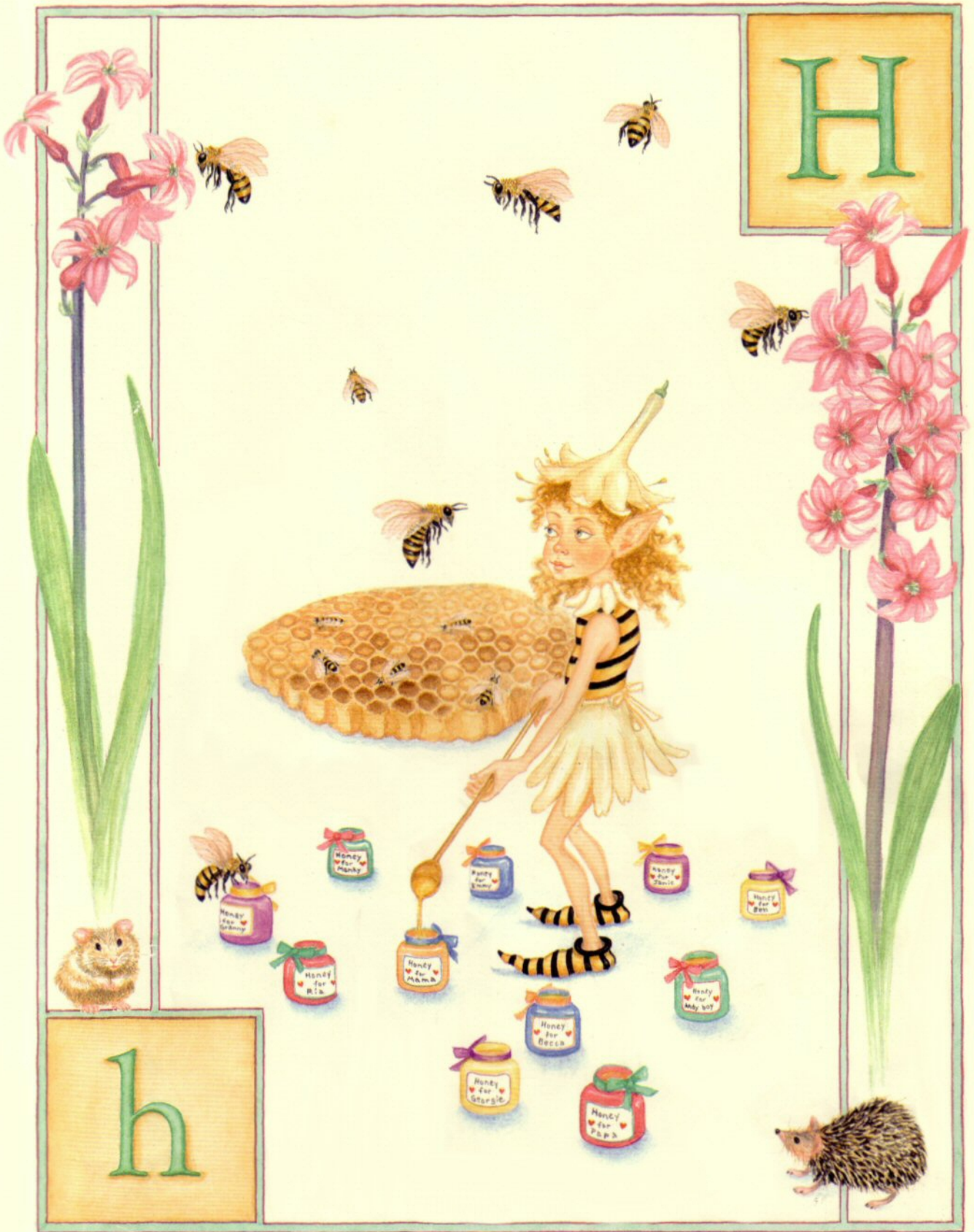
H is for Honey Elf hopefully harvesting.