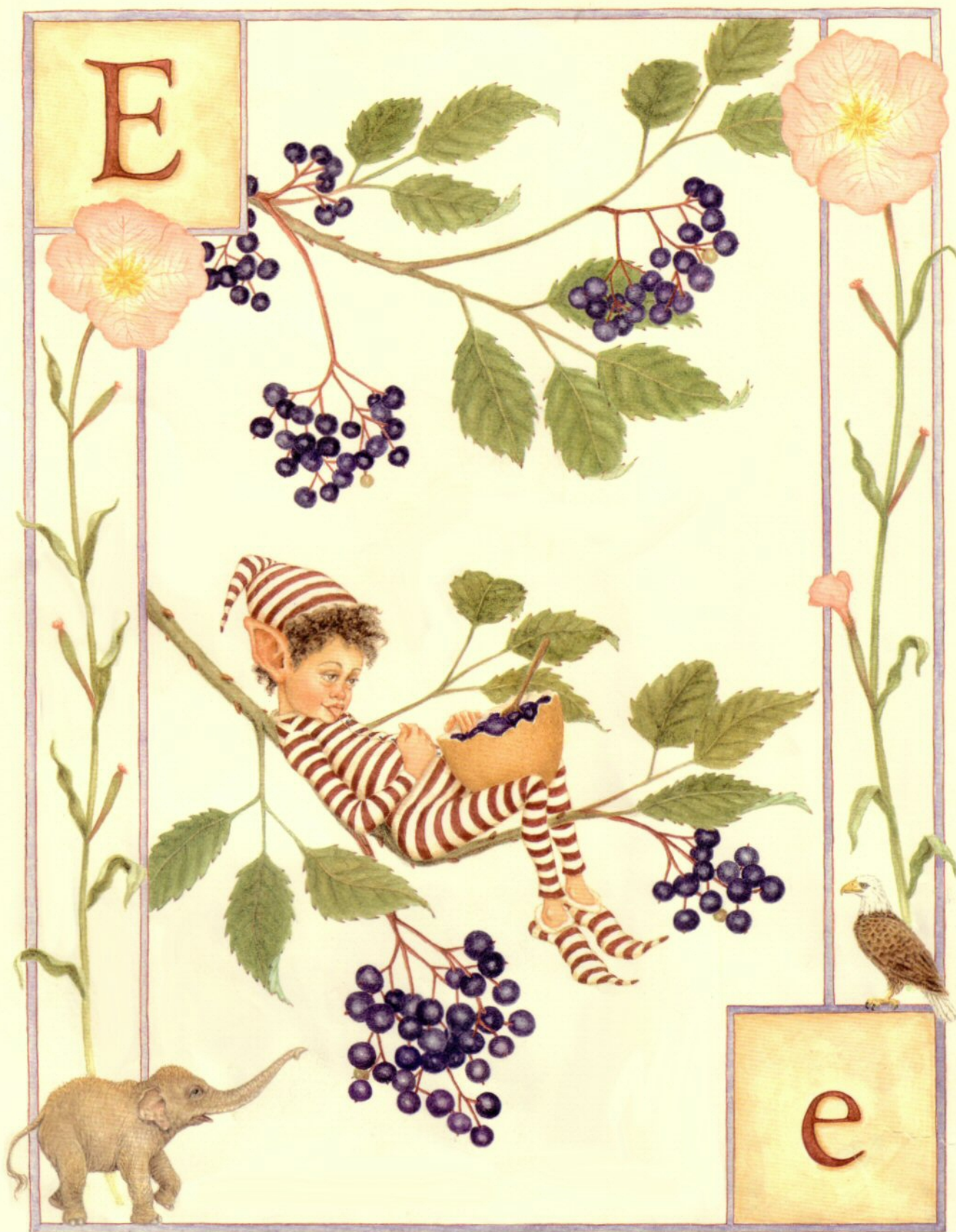
E is for Egg Elf endlessly eating.