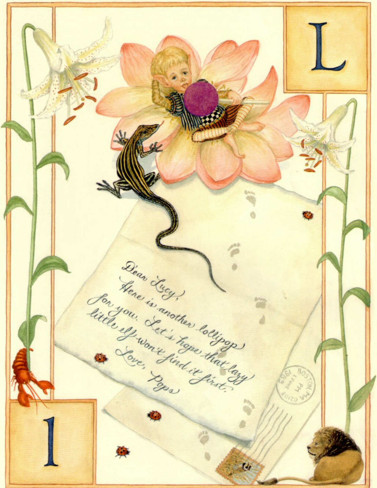
L is for Lollipop Elf lazily licking.