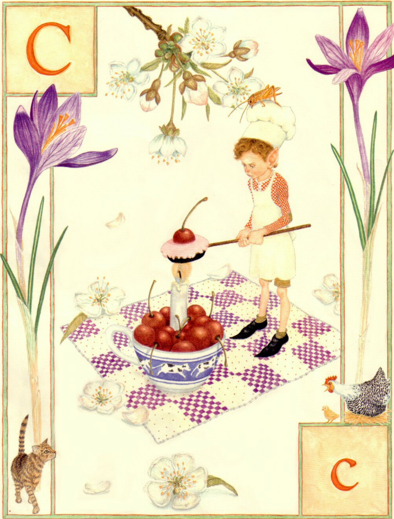
C is for Candle Elf carefully cooking.