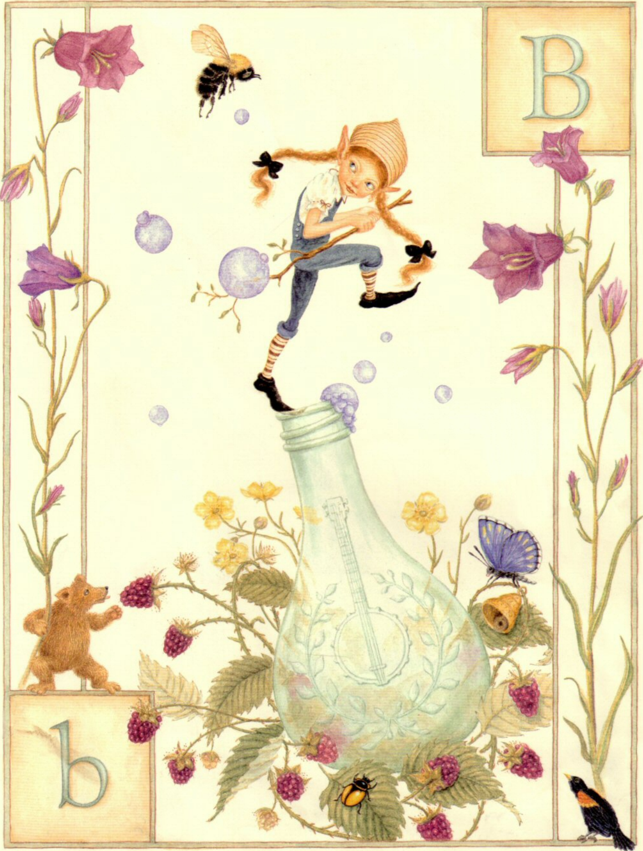
B is for Bottle Elf boldly balancing.