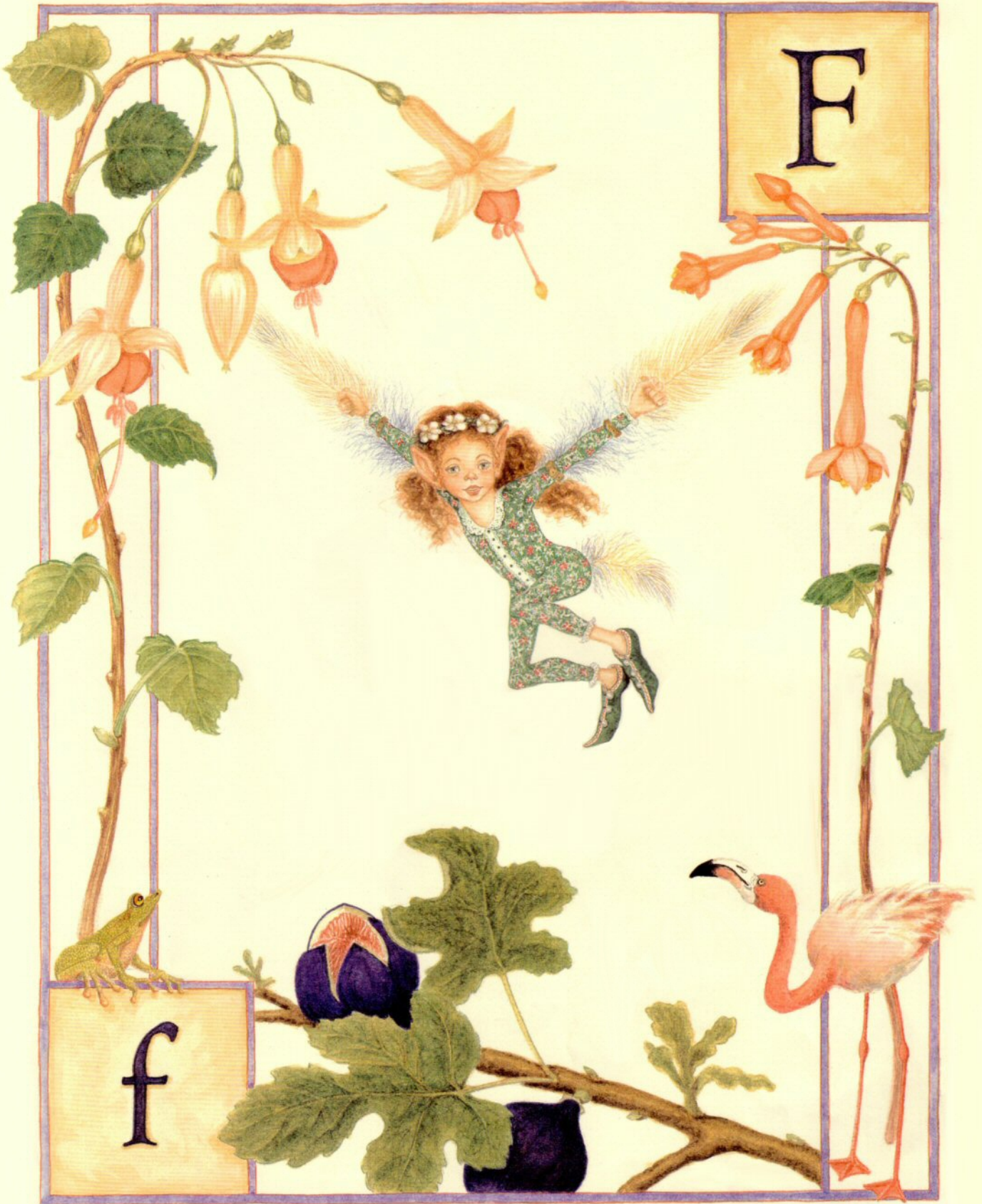
F is for Feather Elf fearlessly flying.