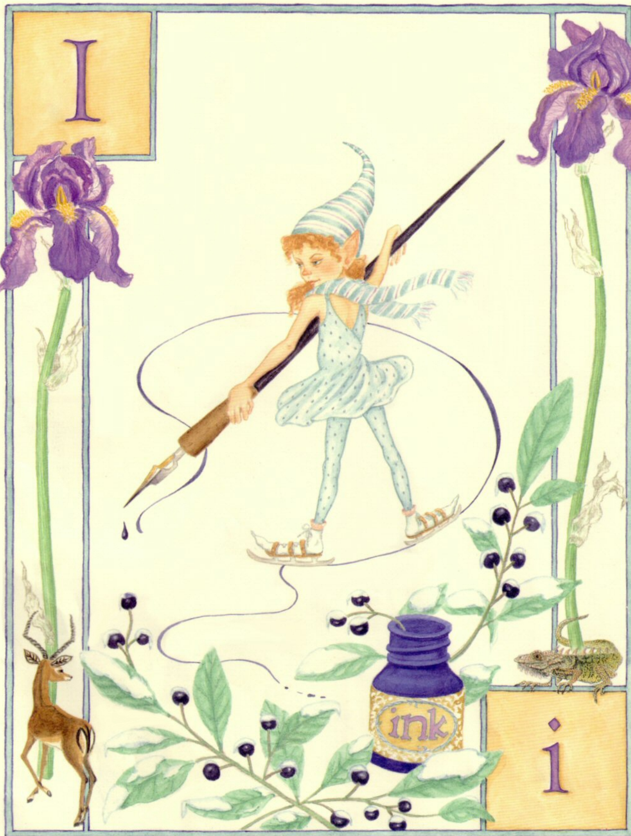
I is for Ice Elf idly inking.