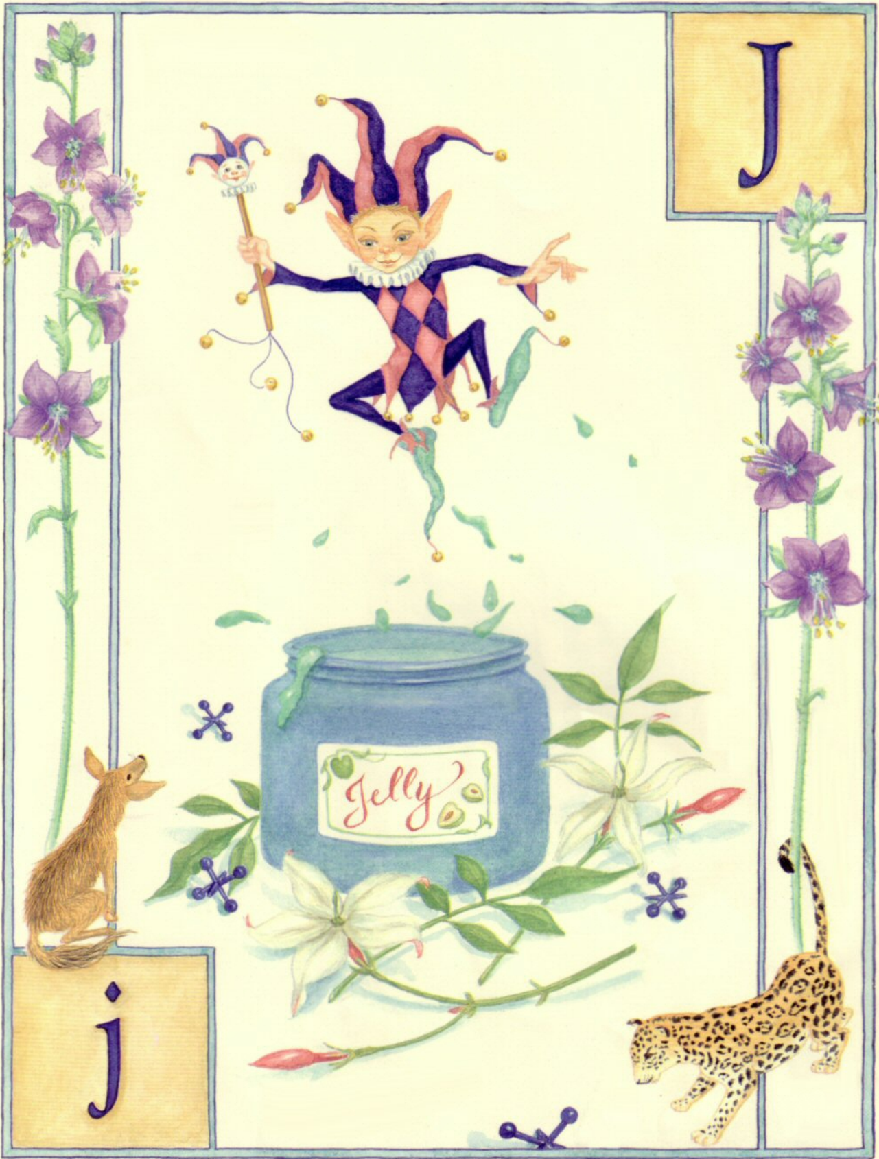
J is for Jelly Elf joyfully jumping.