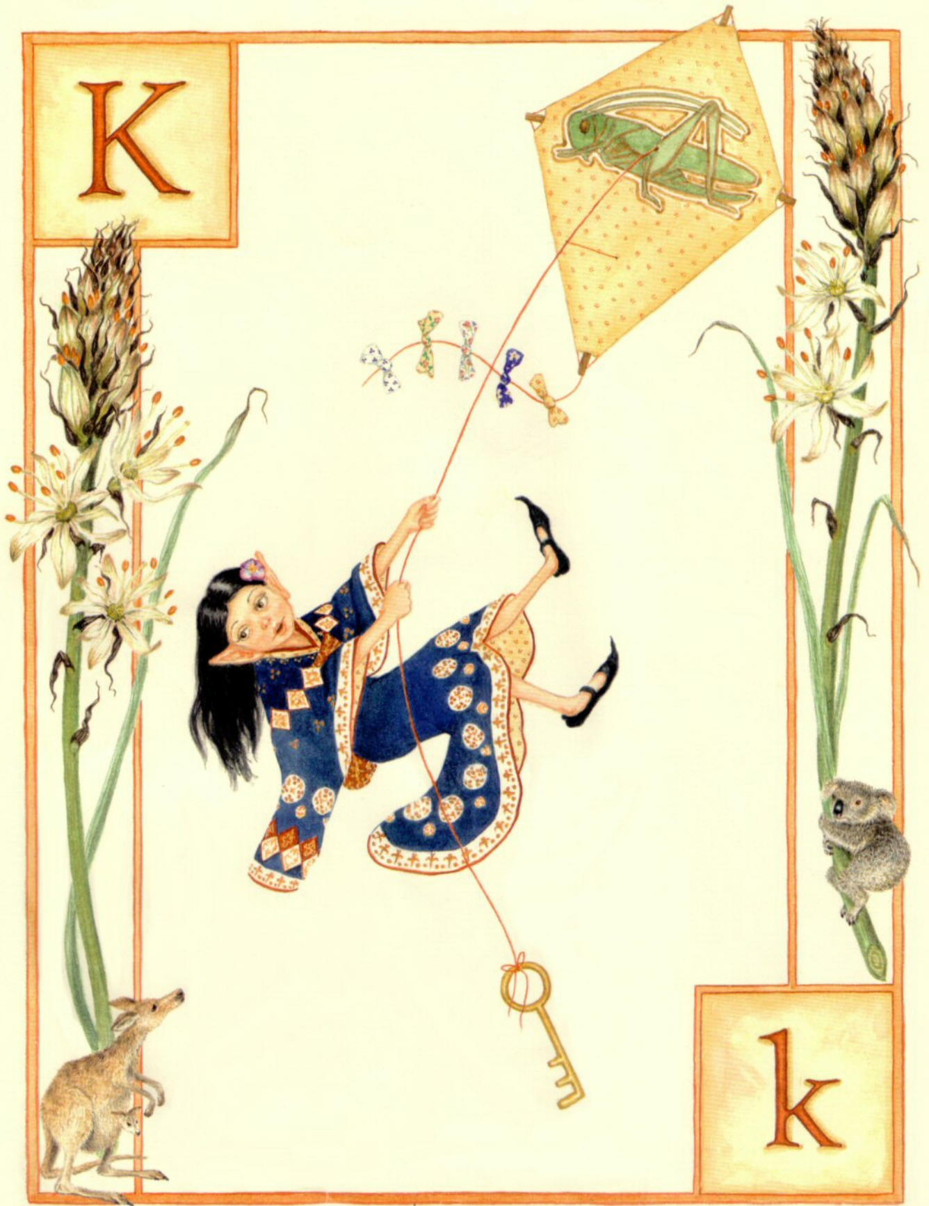
K is for Kite Elf keenly kicking.