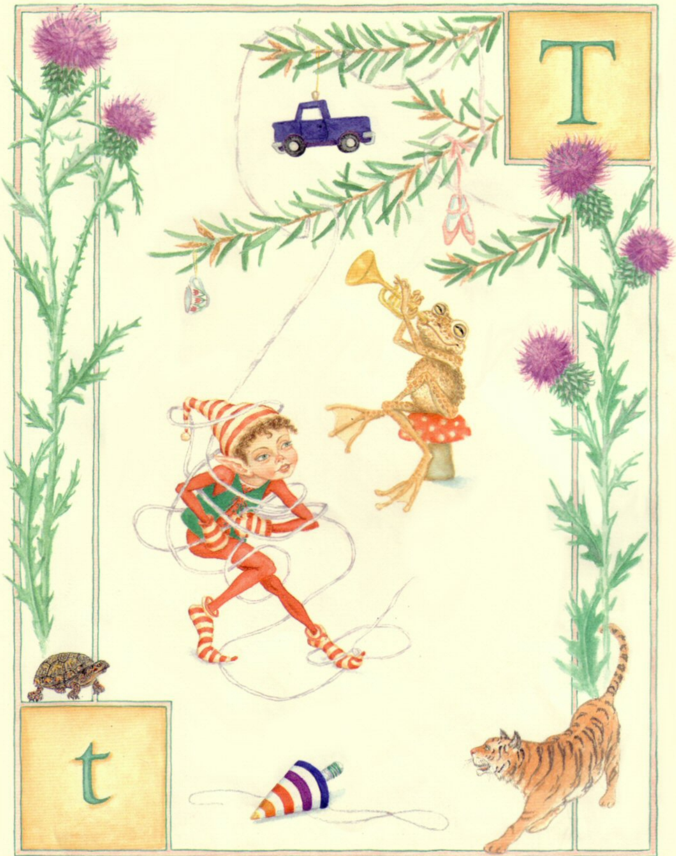
T is for Tinsel Elf terribly tangled.