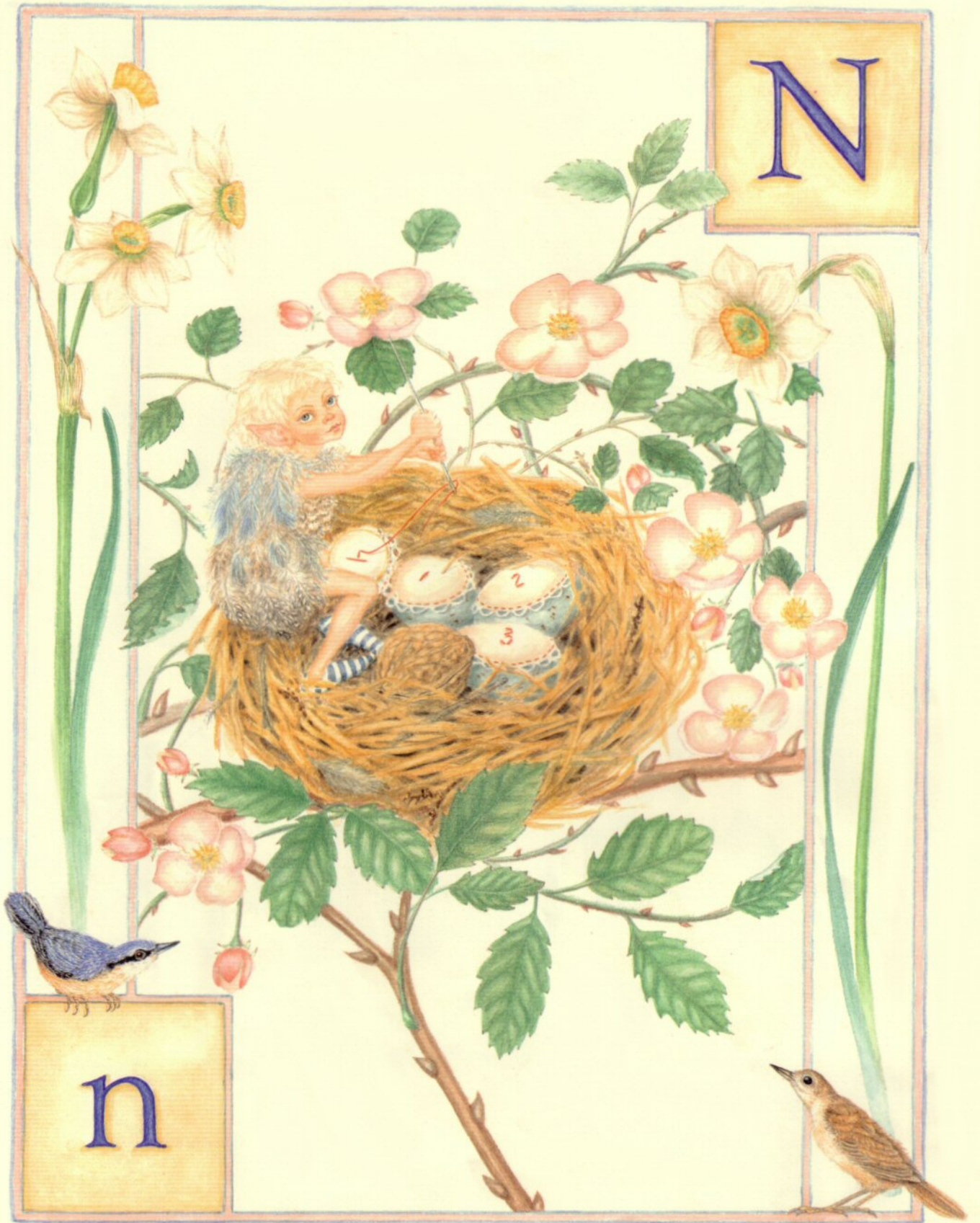
N is for Needle Elf neatly numbering.