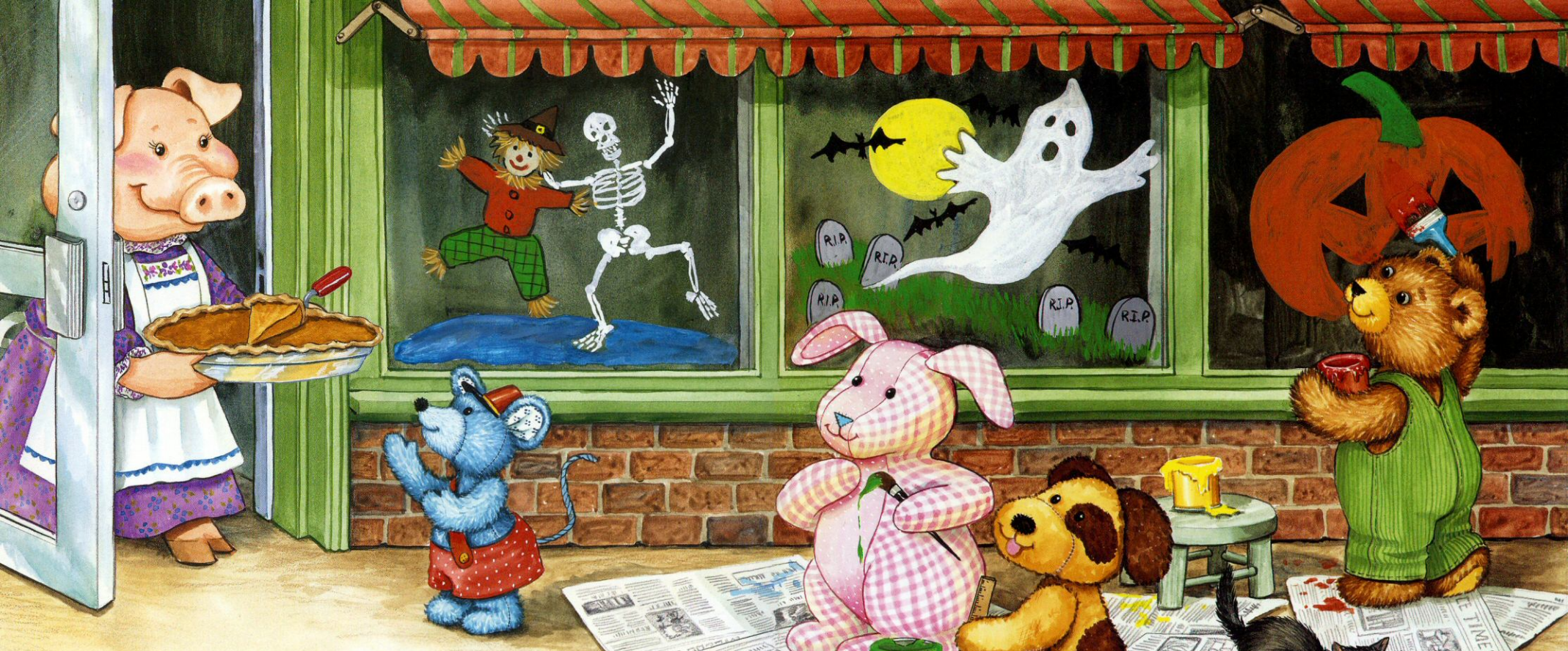
Corduroy and his friends helped Mrs. Pig decorate her store windows. She thanked them with a hot, delicious pumpkin pie. Yum!