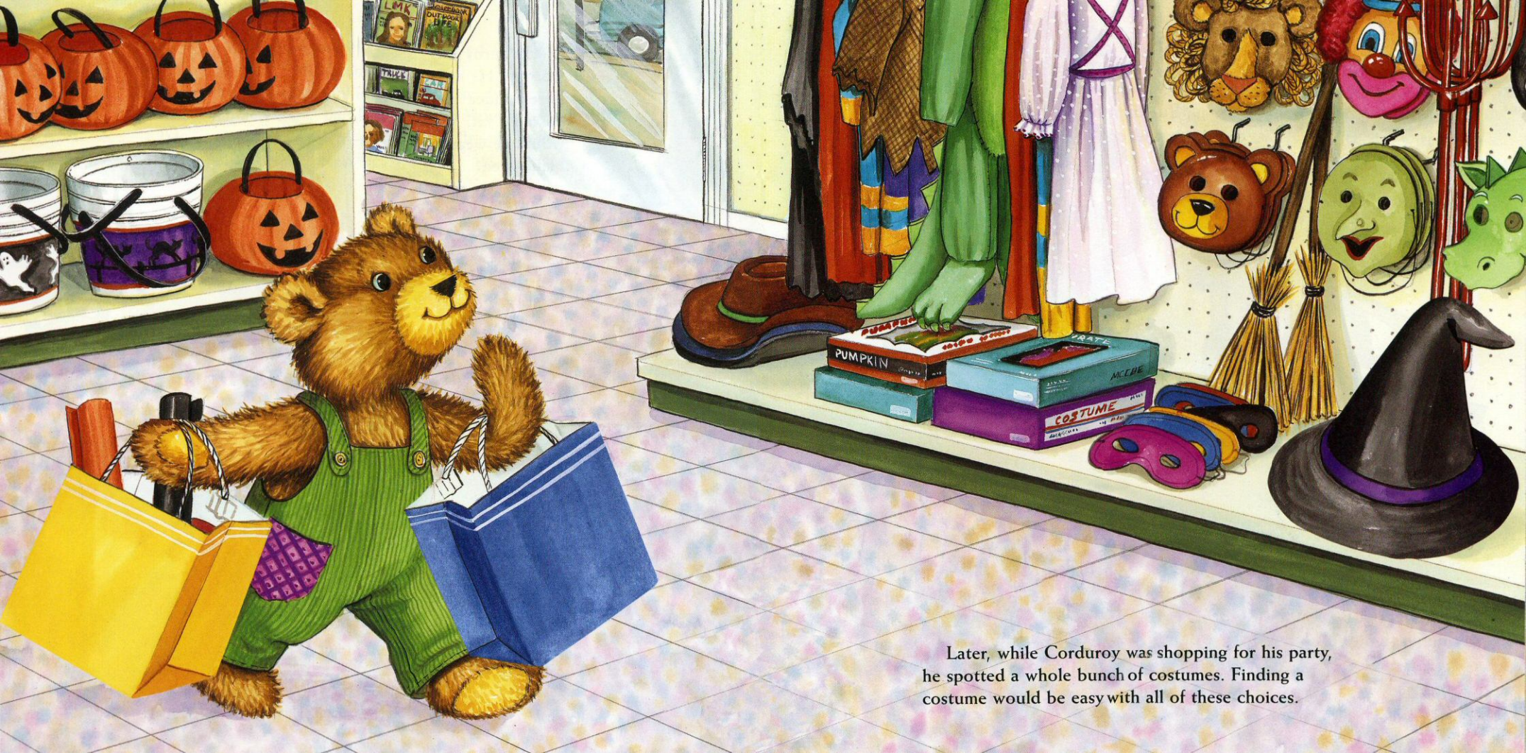
Later, while Corduroy was shopping for his party, he spotted a whole bunch of costumes. Finding a costume would be easy with all of these choices.